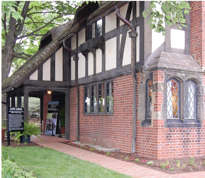
Thousands of people travel to Akron, Ohio each year to walk in the footsteps of Bill W. and Dr. Bob. The men first met here at the Gate Lodge, located at 714 North Portage Path.