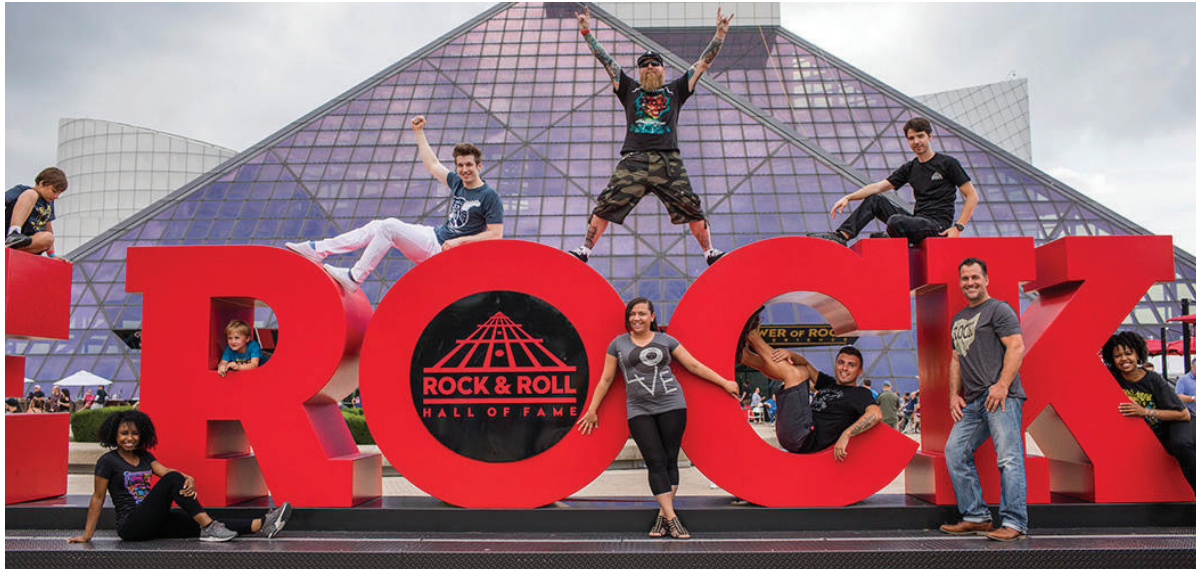
Glenbeigh invites all alumni, family and friends to join us at the Rock & Roll Hall of Fame, 1100 E. 9 th Street, Cleveland, Ohio 44114, for an extraordinary recovery celebration.